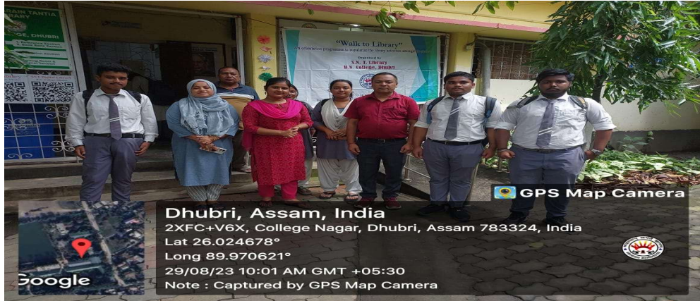
Students of B. A. Ist Semester Sanskrit Major attending the Orientation Programme